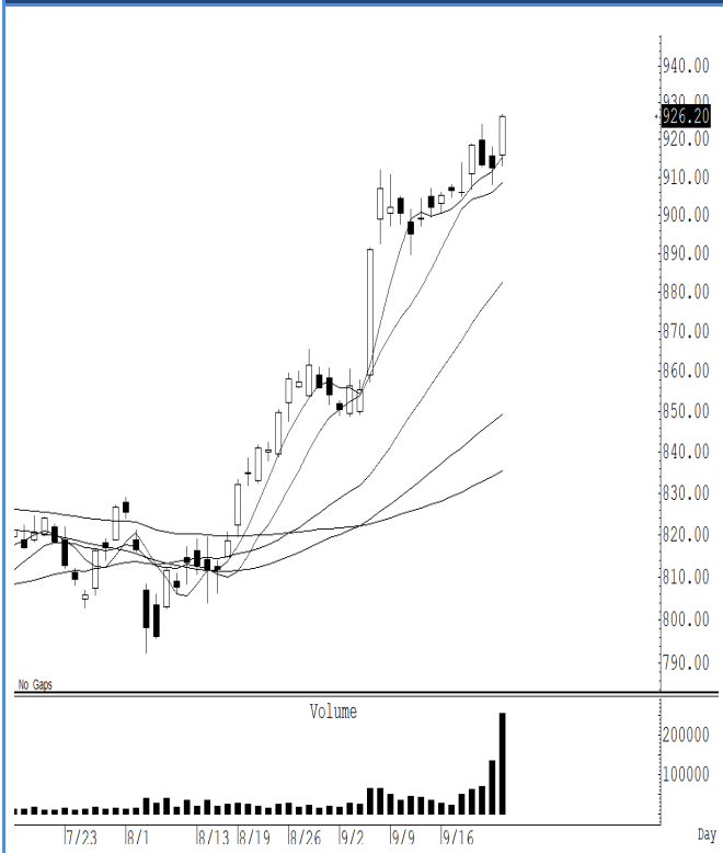
S50Z24 (Close 926.20 Chg 13.70)